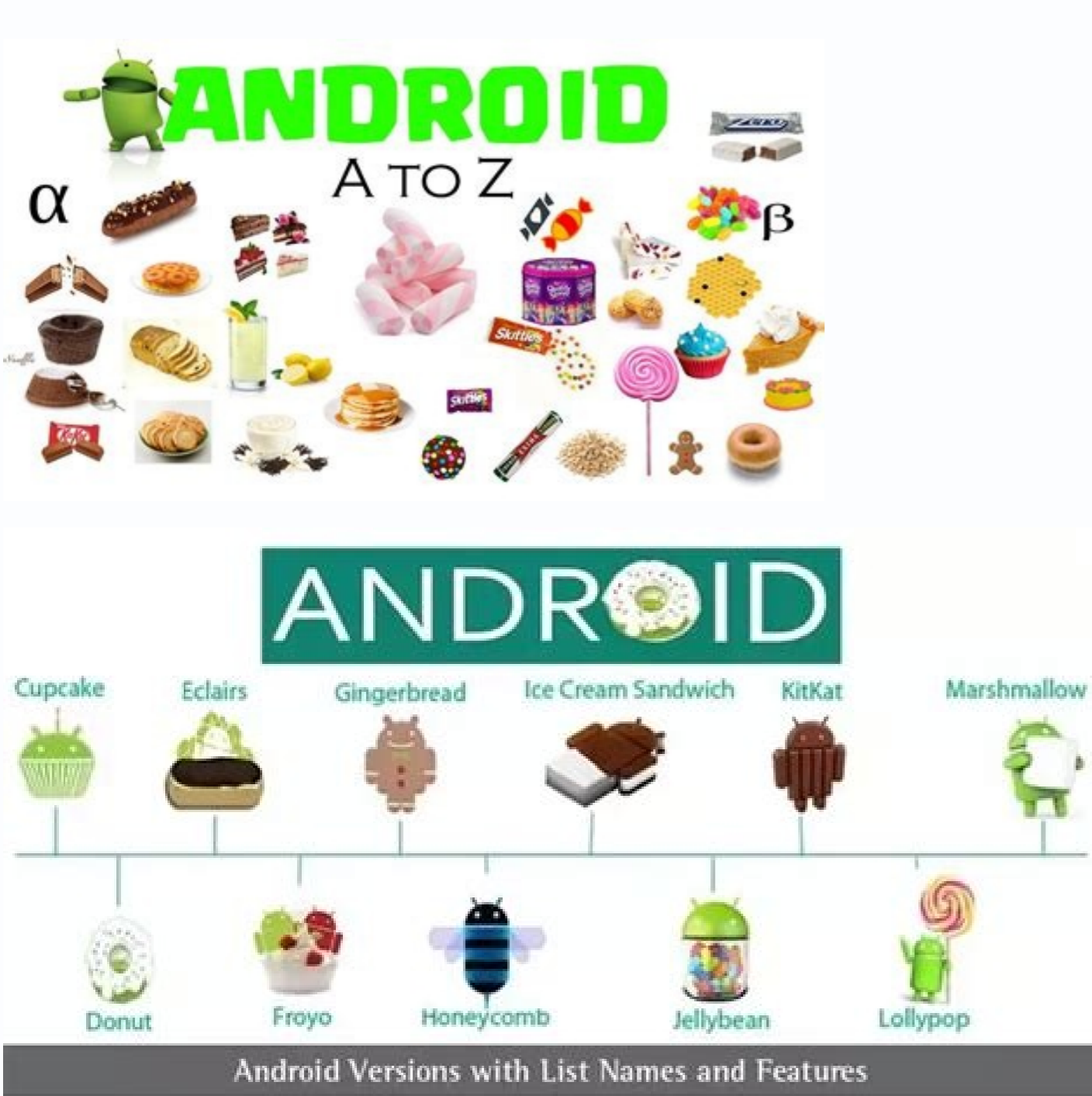
Android Versions with List Names and Features