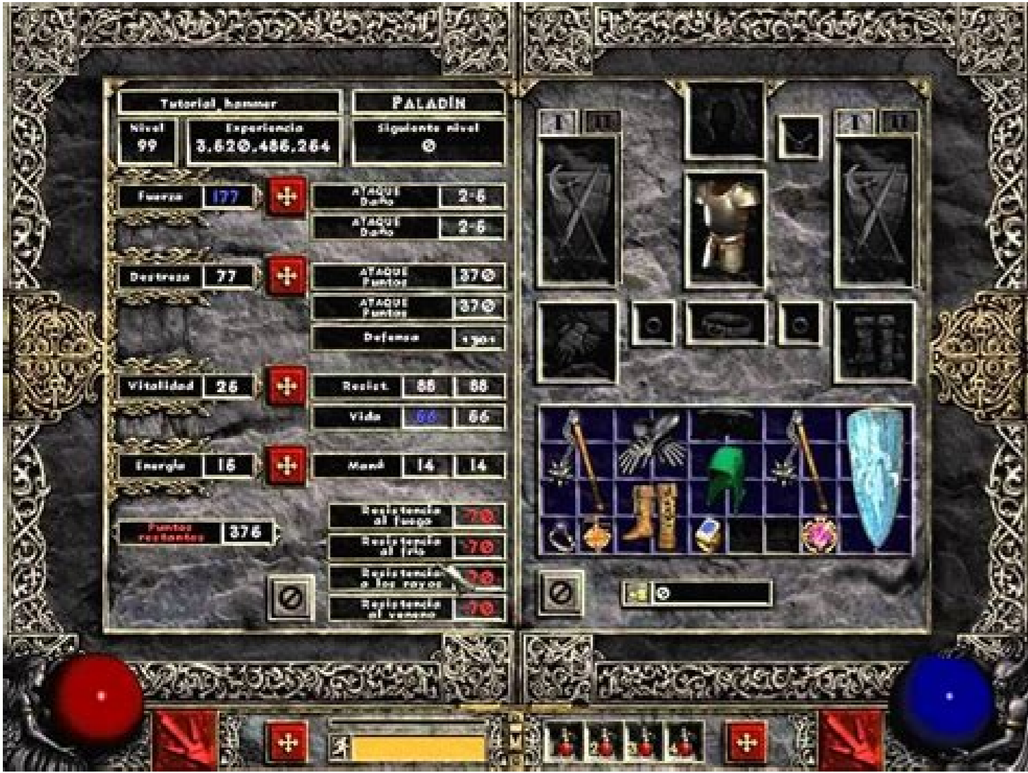
Diablo lord of destruction cheats. Diablo 2 best hammerdin weapon. Best diablo 2 hammerdin build. Best class in diablo 2 lord of destruction.