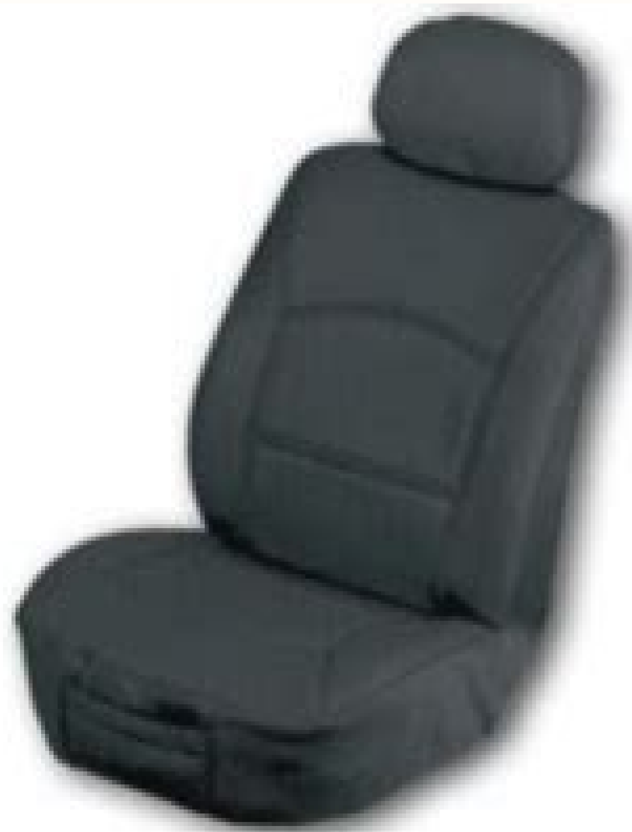
Obusforme heated car seat cushion reviews. Obusforme back & seat heated car cushion review.