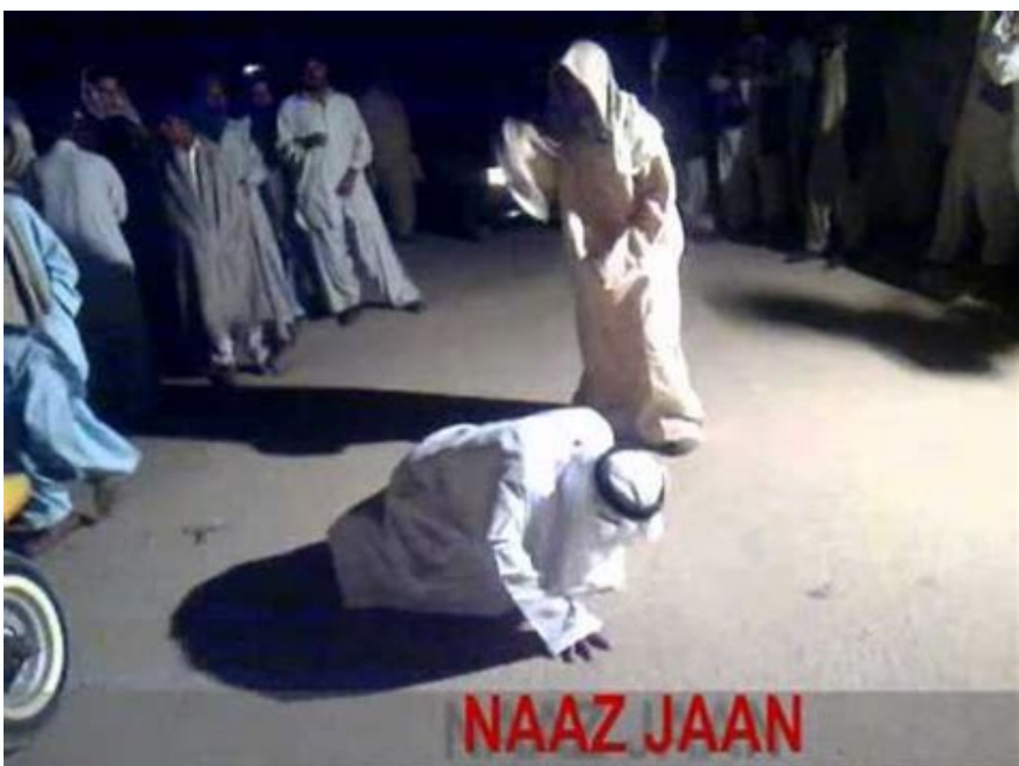
Balochi dance music.