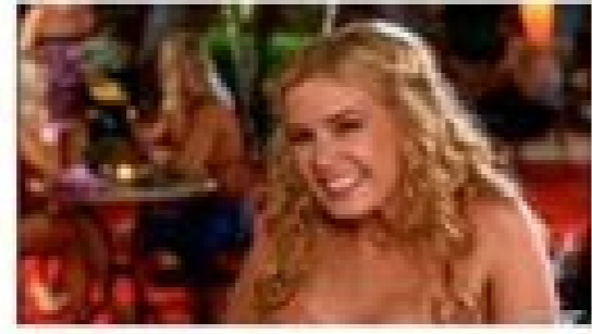
Scooby Doo - Isla Fisher Photo (7760... fanpop.com