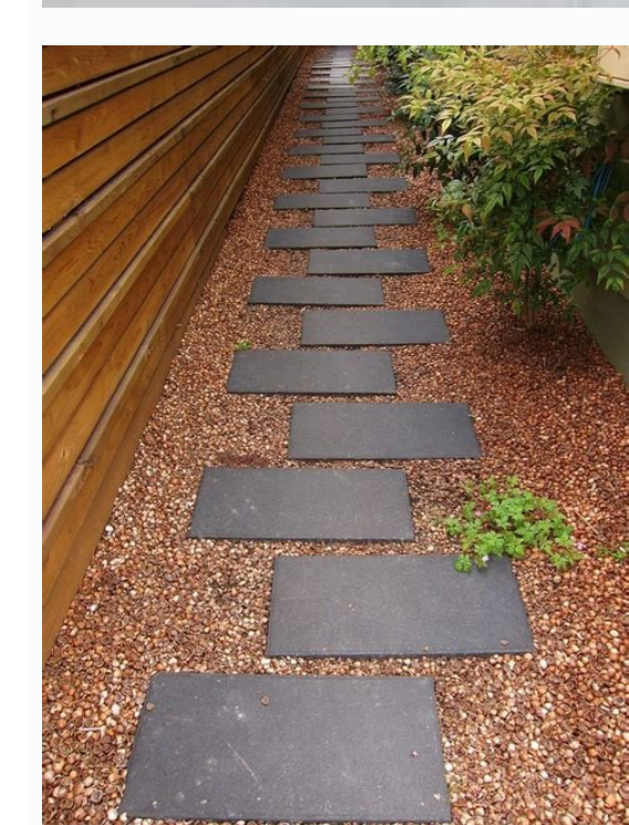
5 examples of 2d geometric shapes. 3 examples of geometric shapes. List of 20 geometric shapes. What are all the geometric shapes. Geometric shapes in daily life.