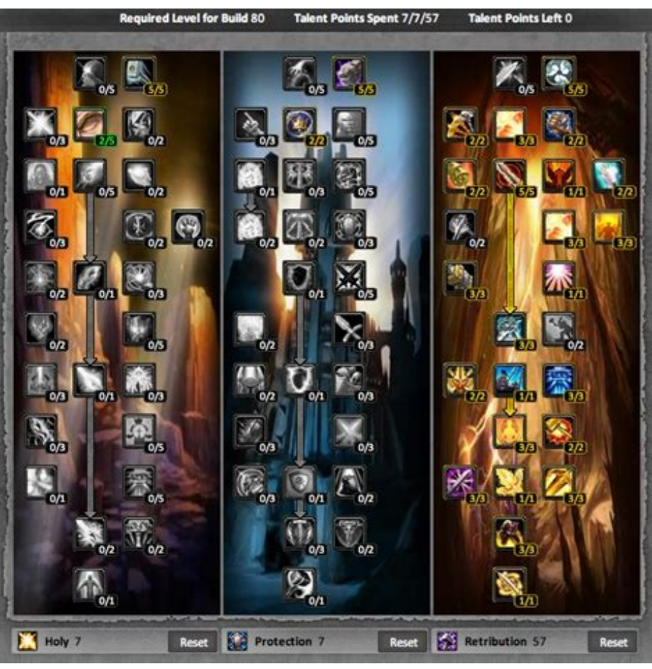
The classic paladin tank leveling guide.